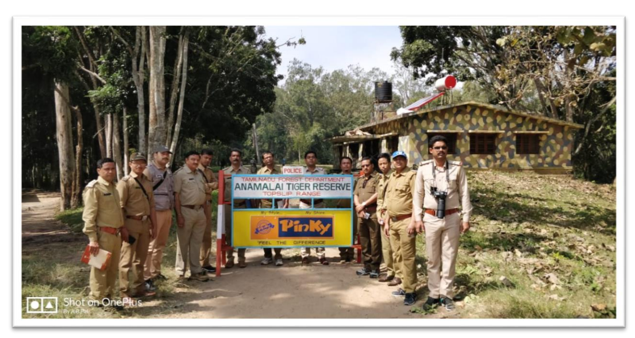
Exposure Visit to the State of Tamil Nadu during -10th-20th, January, 2019